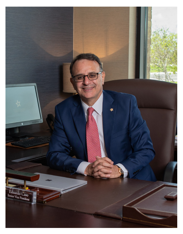
IPB experienced significant growth throughout the past year, and as of September 2019 our numbers reflect the following:

The cornerstone of our division is a team-oriented structure that places highly-skilled IPB bankers at the center of all client relationships, supported by a team of experts (internal and external). We strive to provide exceptional service and prioritize the interests of our clients above all else.